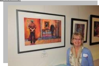
Lois Ward-Wolford Award of Merit

.....more artist photos with paintings available on the website.